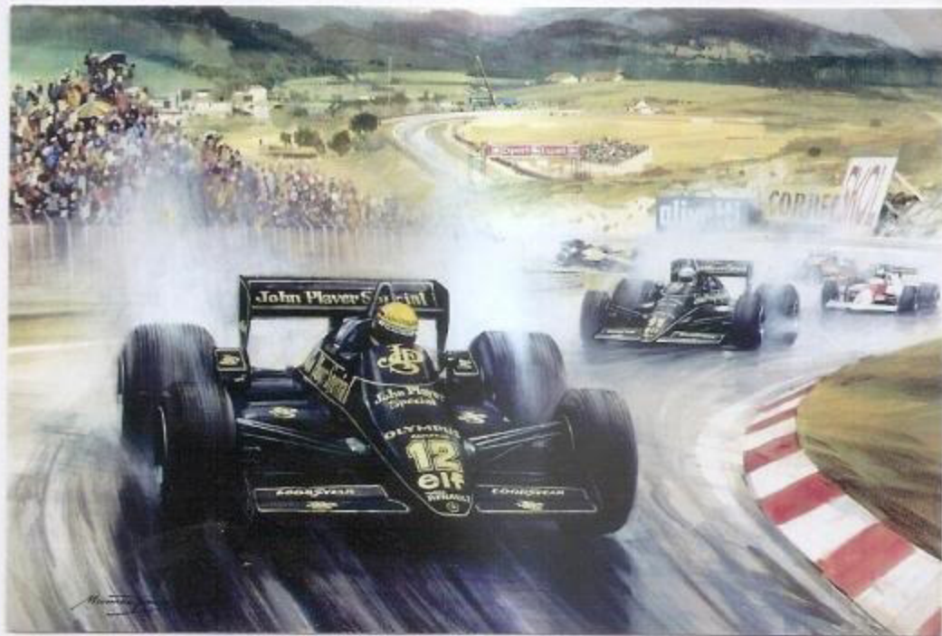
England 1993, Donington Park circuit. Under rain, in the start of racing Senna was in 5 th place. In the end of first lap, he was in first place. Experts says that is the best lap of pilot in the history of formula 1.