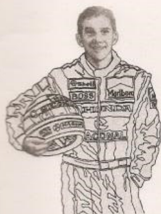
BRASIL - CAMPEÃO MUNDIAL DE PILOTOS FÓRMULA 1 - 1988

1ª dia de circulação Empresa Brasileira de Correios e Telégrafos