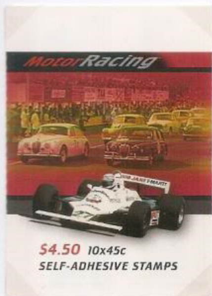
Australia 1993 , Adelaide Circuit. Last Ayrton Senna won in Formula 1. He was also the pole position.

Ayrton Senna was unbeatable in rain. say that even when he was little, seeing a sign of rain appears, already picked up your kart and went to the Interlagos circuit to train.