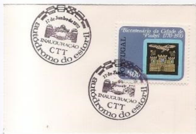
Portugal 1985, Estoril circuit. First won of Senna , with pole position and best lap. Senna demonstrated his proficiency in wet conditions by finishing the race at least one lap ahead of every car except second-place finisher Michele Alboreto.